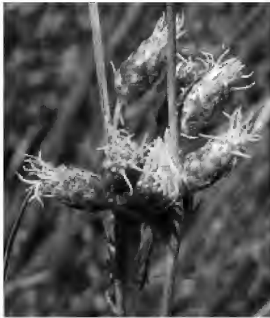
Figure 10. Marsh fimbry ( Fimbristylis castanea ) at Hubbard Marsh.

enheather has not yet been found in New Brunswick, but does occur in Prince Edward Island and Nova Scotia. We were unable to find any little ladies' tresses at that site or a nearby area that has grown up and been converted to a residential area. The term "pine barrens" seems most inappropriate for such a unique and fascinating habitat.